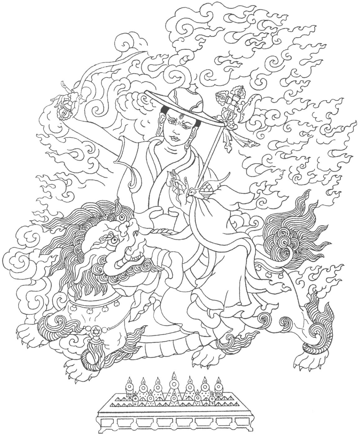
Wisdom Dharma Protector